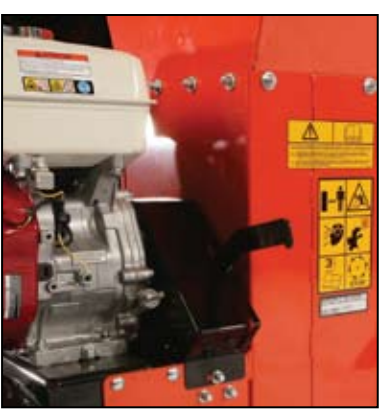
Belt Engagement Lever to allow for easy starting.